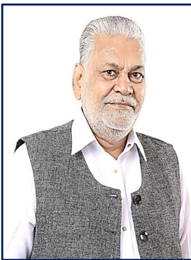
SHRI PARASHOTTAM RUPALA